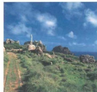
Arakizaki Lighthouse MAP# J-6

A beautiful swimming pool surrounded by the white sand beach and emerald green ocean. The site of the inlet is also used for the camping site, and has shower and bathroom facilities.