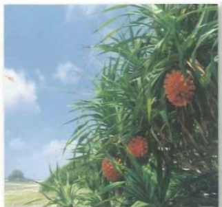
Adan Colony MAP# H-2

A small sized, native species uninfluenced by Western breeds, the Tokara pony has been designated a protected species by Kagoshima prefecture. The ones in the Tokara archipelago are being carefully reared on Takarajima and Nakanoshima.