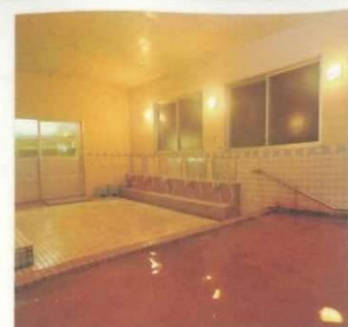
Tononohama Onsen Recreation Centre MAP# G-2

Arakizaki Lighthouse, where you can gaze upon beautiful scenery, and was even chosen as one of the top 100 views in Kagoshima. You can get a sweeping view of a seemingly endless blue sky and ocean. It's our recommended viewpoint!