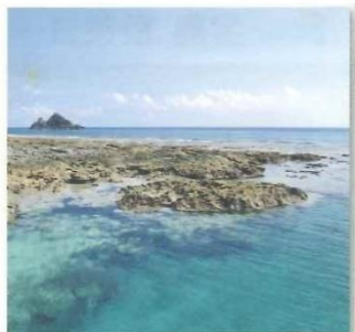
Oma Coast MAP# E-4

Trees that bear fruit resembling pineapple called adan . The tropical atmosphere producing adan is widely known as a motif drawn by the solitary painter, Isson Tanaka.