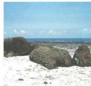
Red Rocks MAP# J-3

Maegomori fishing port, where Ferry Toshima 2 docks. The giant mural before your eyes, with the image of an underwater city, is to warmly welcome visitors to the island.