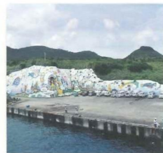
Maegomori Fishing Port MAP# G-2

[Hot spring type] Sulphur-chloride spring [Benefits] Nerve pain, muscle pain, cold sensitivity, chronic skin pain, burns, etc. [Entry fee] ¥200 [Hours] Tuesday, Thursday, Saturday: 17:30-21:00