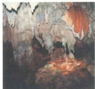
Kannon-do MAP# E-3

The site of a British plundering incident that occurred in 1824. It is said that this incident is what caused the Edict to Repel Foreign Vassals to be enacted.