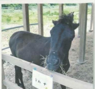
Kagoshima Prefecture Protected Species Tokara Pony MAP# I-2

Imakiradake boasts a view from the observatory with a Tokara horse motif. On clear, sunny days, you can see as far as the distant Suwanosejima.