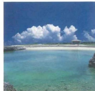
Ogoino Swimming Pool (Cannon) MAP# I-1

The island where it is said that the British Pirate, Captain Kidd, buried his treasure, Takarajima. With the blue sky and white sand beaches made from coral reef, and the emerald green ocean, this island is overflowing with beautiful multicoloured scenery. Please fully enjoy the southernmost island in the Tokara archipelago!